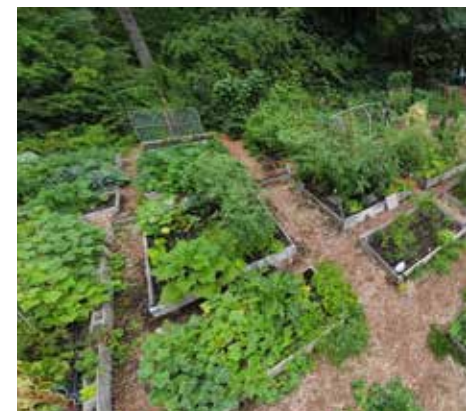
Mirrmont Pea Patch